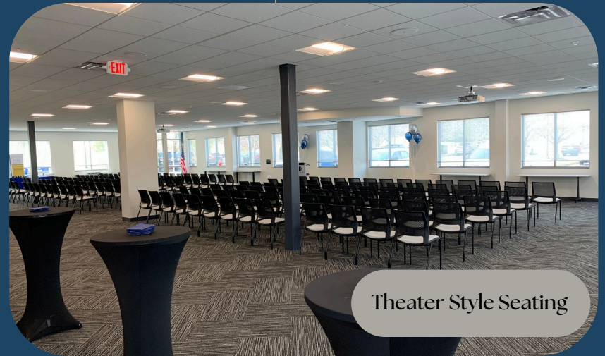
Theater Style Seating