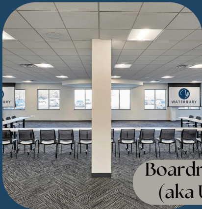
Boardroom Style (aka U-shape)